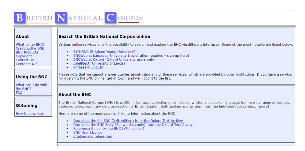
Fig. 1. BNC user interface