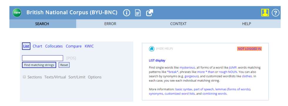
Fig. 2. BNC search interface