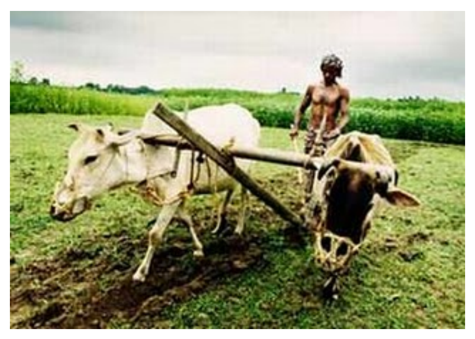
Fig. 1. Present Irrigation System in India