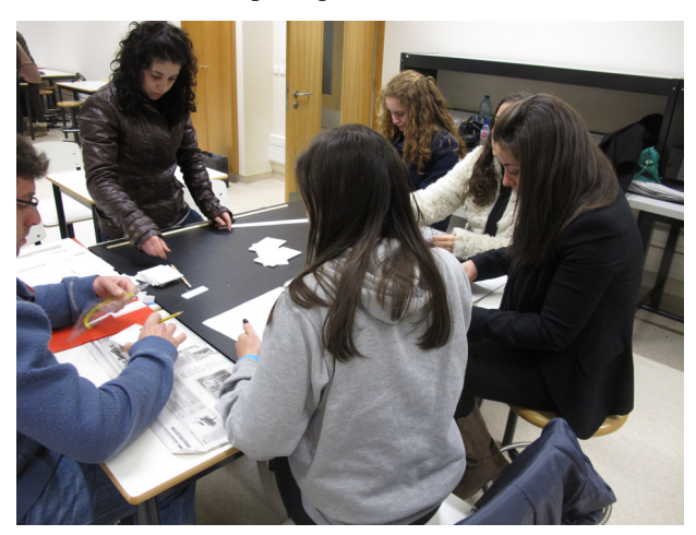
Figure 2. Evening class in Portugal

The emphasis in the first pilot was on the students and the evaluation focused therefore very much on the perception of the students regarding the seven principles of the reAct methodology. The objective of the methodology is to help the students to change their attitude, become open minded and develop a learning skill. Since the time for the reAct program is limited to four to six hours a week, we expected not to be able to measure any of these high level objectives, but to measure the perception of the students in relation to the seven principles.