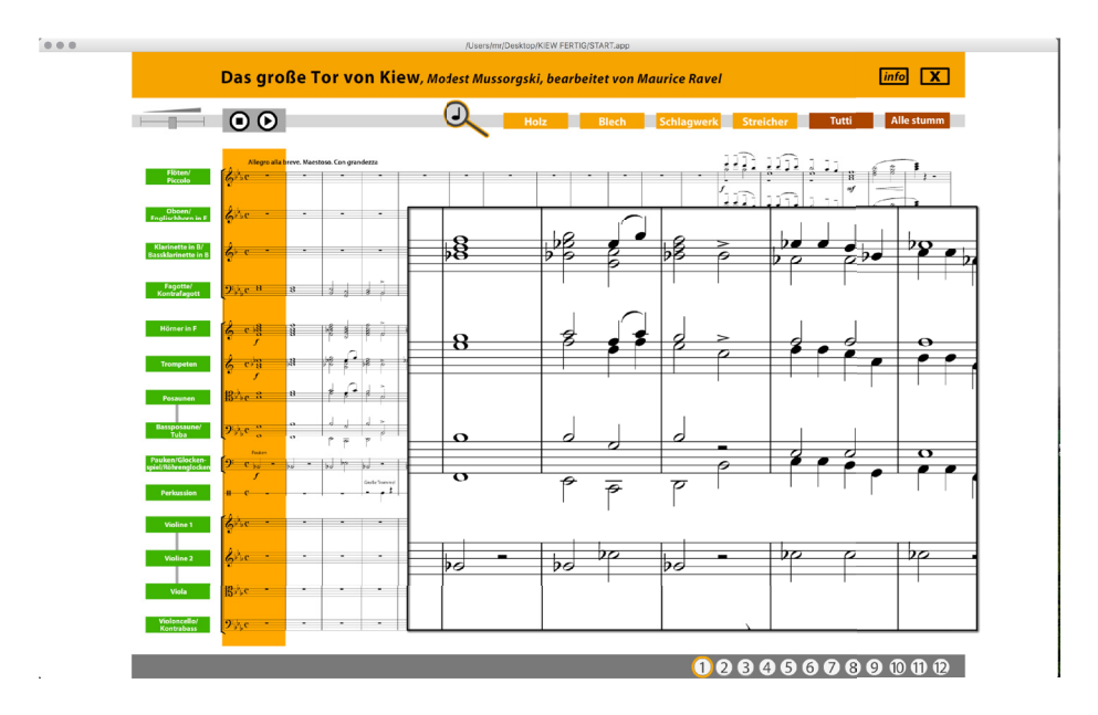
Fig. 3. Animated interactive score

With the wish of continuous improvements of multimedia content the latest music based animations were created with Adobe Animate. The digital material would be great on surfaces like tablet computers, but our university doesn't have a single device. The students are still not using private tablet computers in a quantity to get them involved with this equipment in significant learning processes. Some of them are using smartphones for searching the web and especially for social tools, many of our students are using university infrastructure for their e-learning situations; windows based personal computers in computer rooms. We are still focusing on production of interactive scores either on orchestral pieces and otherwise on choral scores. These advanced interactive apps are showing synchronized animations to streamed audio files. Streaming makes it also possible to use larger audio documents with animations and scores simultaneously by a group of students. So the listeners get possibilities to concentrate on single instruments, groups of instruments or the whole orchestra. The production of every single animated score is still a time-consuming process. The three main steps are building the digital score, recording the instruments and programming the animation.