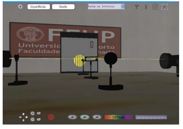
Figure 2. Virtual Michelson Interferometer