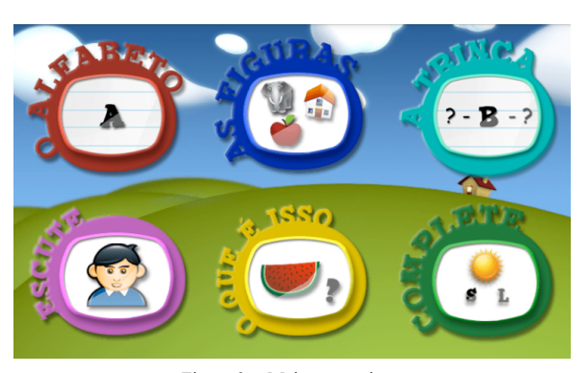
Figure 3. Main game view.