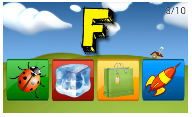
Figure 8. Choose the correct images.