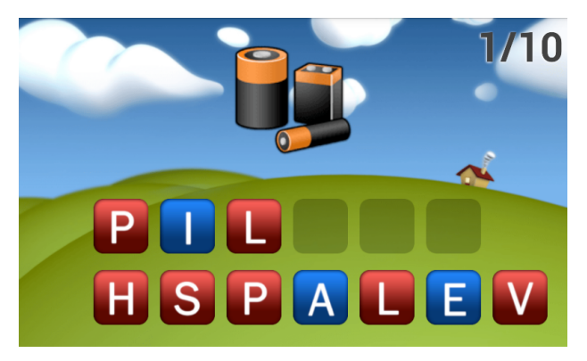
Figure 6. Complete the word.