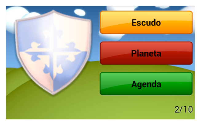
Figure 5. Image-word relation game.

Finally, the new game is a combination of the Alphabet Game and the Complete Game, called Trinca (or Triplet), where one letter is given and the player should complete the two empty spaces with its neighbor letters. The given letter may be at any position available in the group. The game changes the position and letters showed randomly each phase, helping the children memorize the alphabet in a different way than the Alphabet Game. An example is showed in Figure 9.