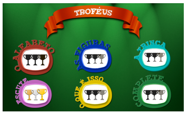
Figure 10. The trophy room.

As mentioned before, to motivate the player a trophy is awarded at the end of each game. The trophy varies from gold, to silver, to bronze, depending on the game final grade. A trophy room is available for the user to check all the trophies he/she has been awarded. Figure 10 shows the trophy room.