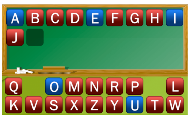
Figure 4. The Alphabet Game.