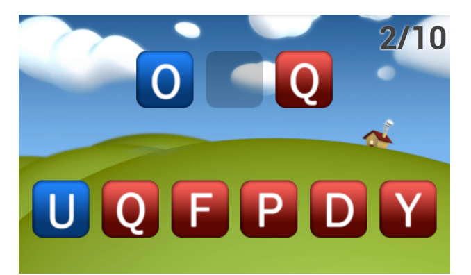
Figure 9. Triplet.