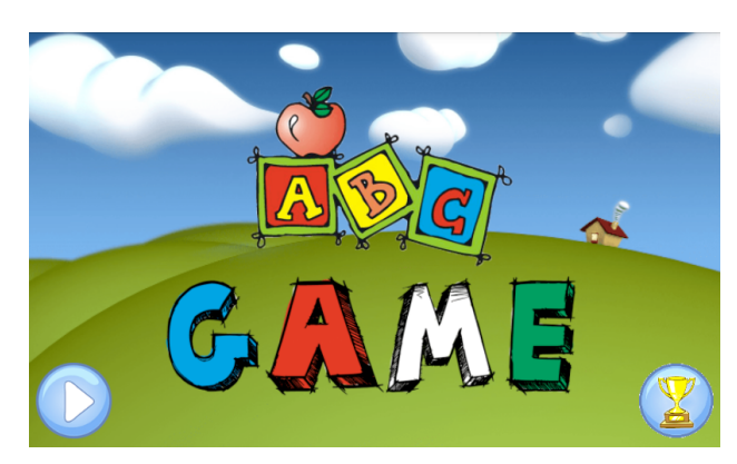
Figure 2. Initial game view.