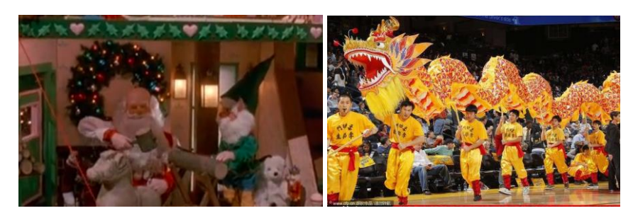
Fig. 2. Westerners' celebrating Christmas and Chinese celebrating the Spring Festival

Step 2: The teacher played two video clips successively on PPT. One was about Westerners' celebrating Christmas, the other about Chinese celebrating the Spring Festival (see Fig. 2). Then she asked students to describe and compare the two festivals.