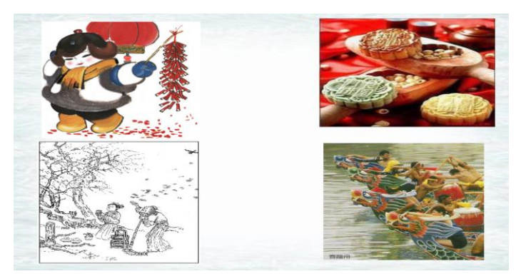
Fig. 3. Pictures of some traditional Chinese festivals