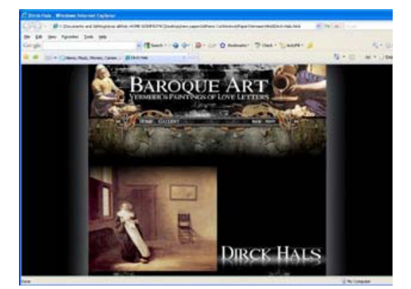
Figure 3. Dirck Hals, The Letter, 1630.