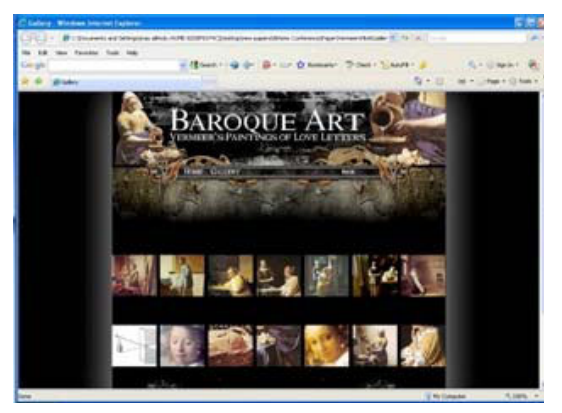
Figure 4. Gallery Page, details.