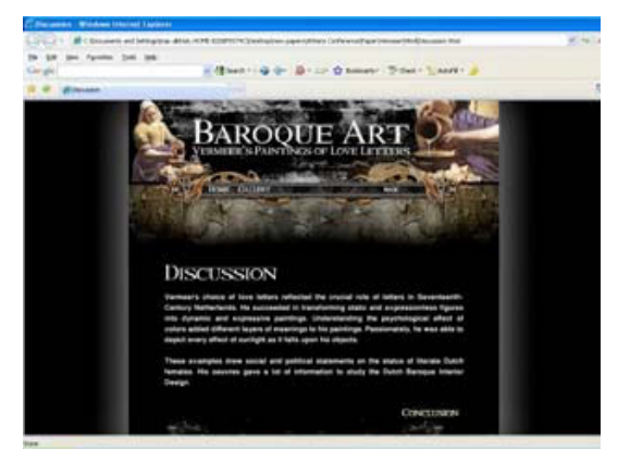
Figure 11. The Discussion Page.

The paintings stand out by simplicity of compositions. Vermeer always deals with young women who either stand or sit in the center of the composition. His paintings are full of local furniture, Oriental rug, colorful drapery and an open window on the left side. The viewer is confronted with Vermeer's sensibility and originality; the stillness that stands out, the inner absorption, the remoteness from the outer world.