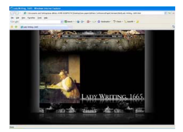
Figure 7. Lady Writing, 1665.