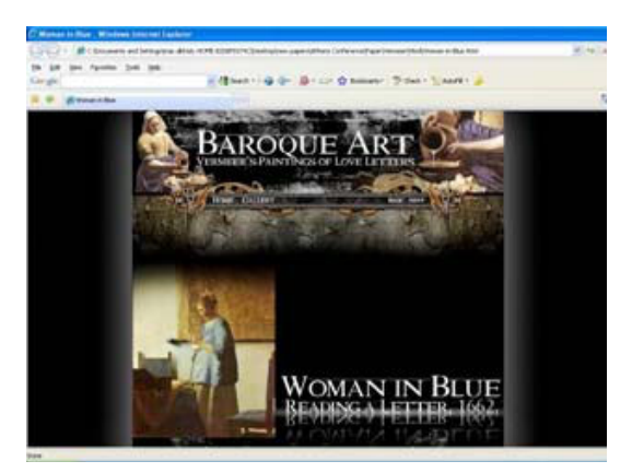
Figure 6. Woman in Blue Reading a Letter, 1662.