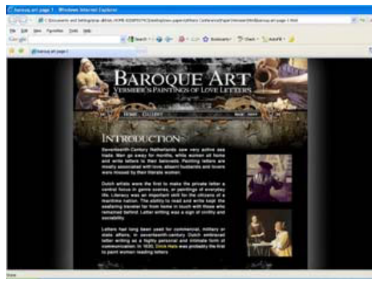
Figure 1. Home Page, Introduction