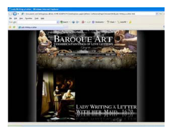
Figure 10. Lady Writing a Letter with her Maid, 1670.