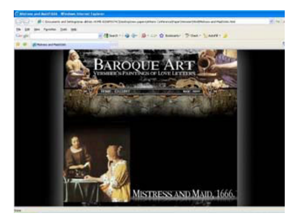
Figure 8. Mistress and Maid, 1666.