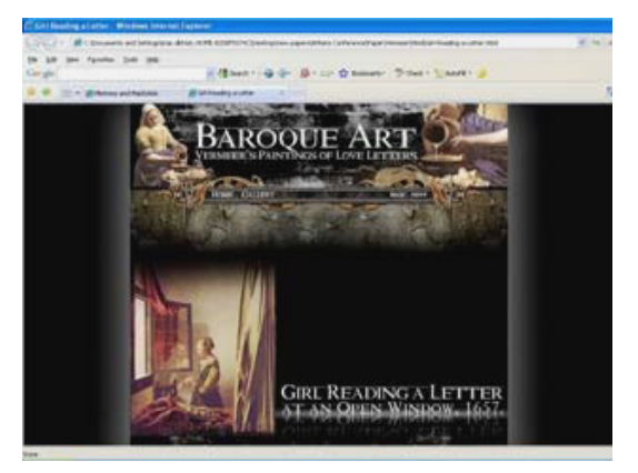
Figure 5. Girl Reading a Letter at an Open Window, 1657.