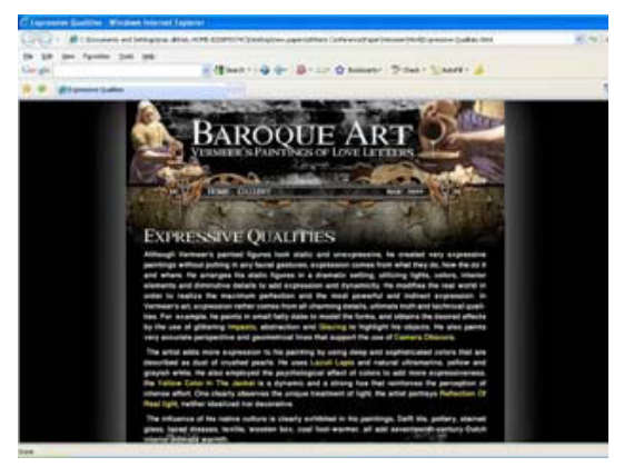
Figure 2. Interior Elements in Vermeer's Paintings.