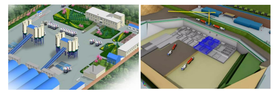
Fig. 3. Main scenes of concrete mixing station and large-scale concrete foundation construction site