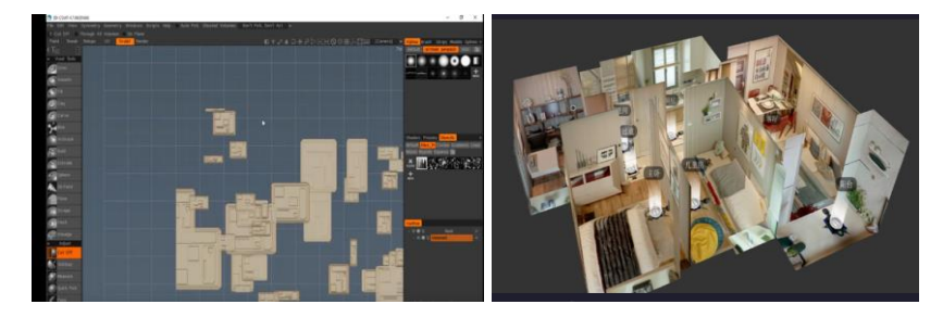
Fig. 2. 3D Coat modeling of the construction site (left) and 3ds Max rendering of the interior decoration (right)

There are many kinds of decorative materials in module II, but excessive varieties for VR scenes will directly affect the speed of exporting and opening the scene. In this system, the real-time rendering was used, that is, the results can be seen without any waiting time after changing the variety [16]. Therefore, only by setting the color, shape model, and keyboard model of the materials in advance, one can try different combination schemes as WYSIWYG, even if there are a large number of varieties.