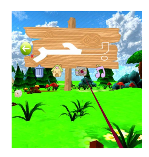
Fig. 2. The first learning experience (Version 1)