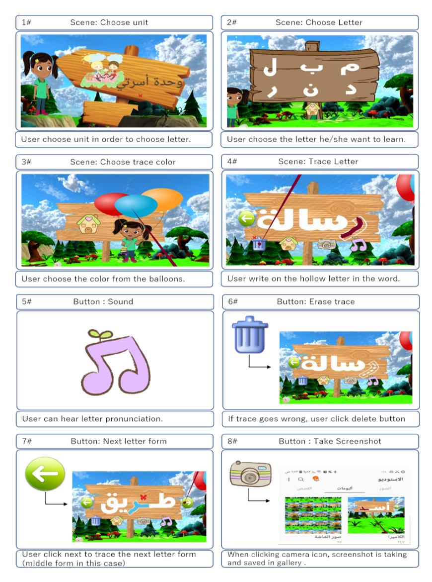
Fig. 1. Story board

After collecting the requirement from teachers and parents using two different methods questionnaires and interview, the specification of the application has been finalized. In this paper no technical details will be discussed. Therefore, a storyboard of the final application will be shown below in figure 1. Technical details will be discussed on future paper.