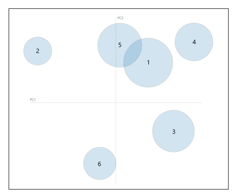
Fig. 3. Distance map between topics

Topic 'Educator (1)' was identified as the most significant topic, affirming that FL in university is designed to enable and facilitate student understanding beyond traditional methods. This topic was the most related concepts which explains the key features of FL in university (e.g., 'understand', 'video', 'information'). The topic indicates that individuals have understood what is being learned through FL and learned information from video materials. Below are illustrative examples for this topic: