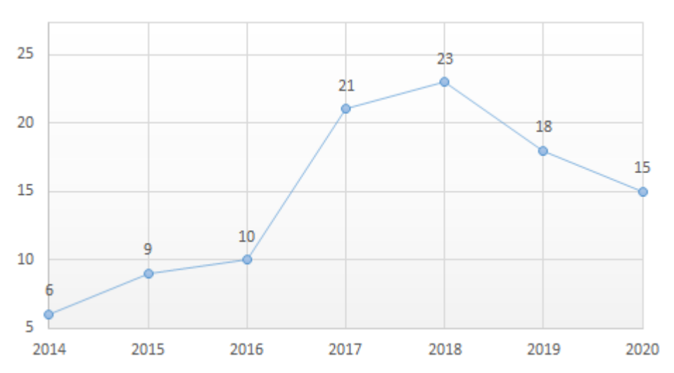
Fig. 1. Annual distribution of articles