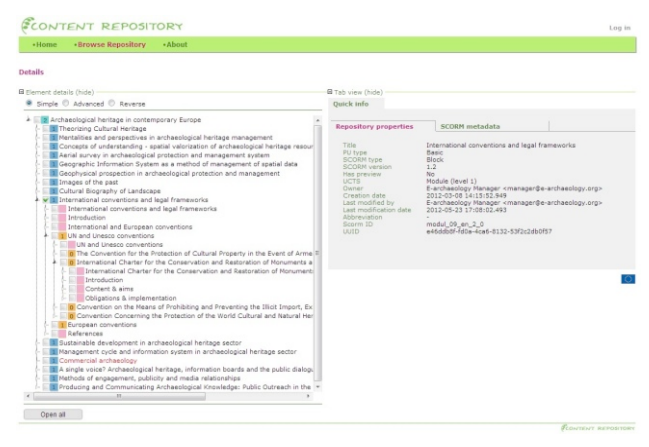
Figure 3. Presentation of PU structure

Logged-in users may upload SCORM-saved contents in the Content Repository. This functionality jest designed for those users who own e-learning courses and are willing to share them with others. After loading the e-learning course as a SCORM package, the user may ascribe didactic interpretation to its components (Figure 4). This operation creates a base PU. Then it is also possible to describe any element using LOM metadata and to ascribe tags. The user may also determine access rights (publication, presentation of component contents, right to download).