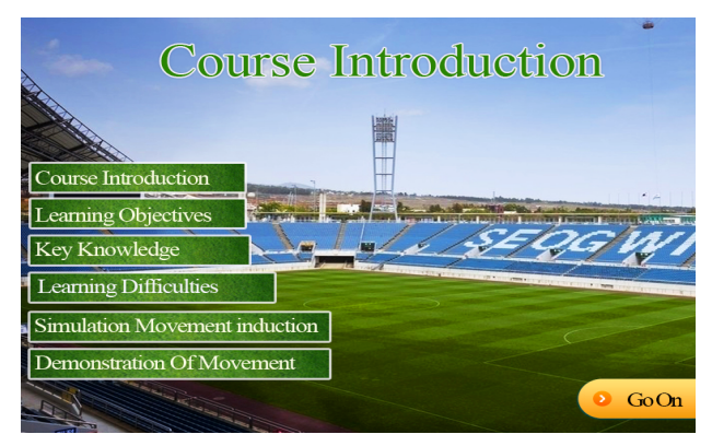
Figure 2. Main interface of distance education platform of panoramic teaching