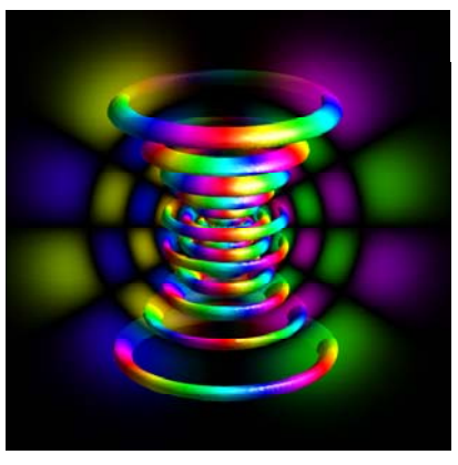
Figure 3. Hydrogen wave function.

sphere, where colors occur with the maximal saturation and are therefore easily distinguished.