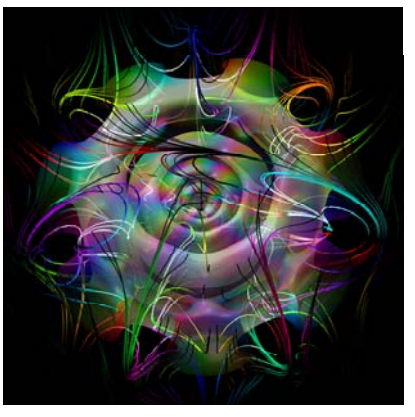
Figure 4. Superposition state with spin.

Teaching with the help of animations implies changes in the approach to quantum mechanics and a shift in emphasis for the development of the theory. For example, while conventional books emphasize stationary states, the main focus of our presentation are time-dependent phenomena. The software not only contains learning objects for self-study and as a supplement of conventional teaching, but also provides tools for explorative learning and creating animations. The first book, dealing mainly with one-and two-dimensional quantum systems, has won the European Academic Software Award EASA 2000 with a special mention of the jury for outstanding innovation in the field. The second book has earned the EASA again in the year 2004. It deals mainly with threedimensional systems, particles with spin, relativistic quantum mechanics, and quantum computing. Figure 3 shows, as an example, an electronic state of the hydrogen