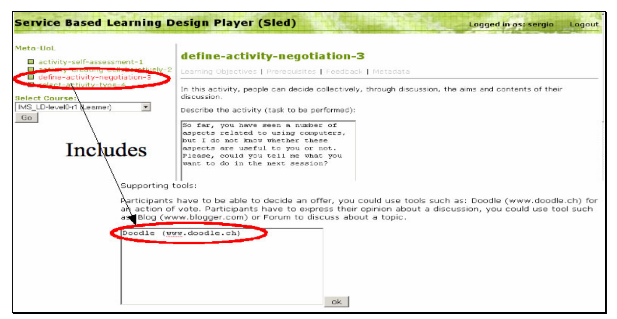
Figure 6 The user selects the activity negotiation as the third one. He proposes the recommended tool Doodle as the supporting tool.