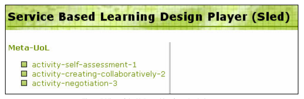
Figure 7 View of the UoL resulting from the design process