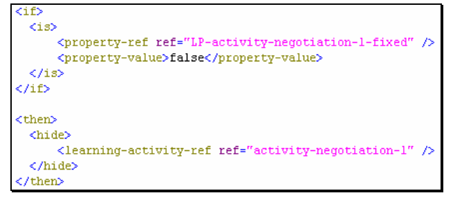
Figure 3 Conditions are used for showing and hiding the corresponding activities as a result of the user's selection.

Finally, the effects of showing and hiding the corresponding activities are achieved with conditions (Fig. 3).