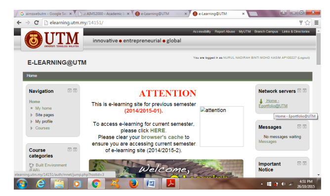
Figure 1. Example Moodle site

The ATutor platform is an LMS that is based on open source web technology used to develop and present online courses [29]. The leader can copy, distribute and edit the ATutor under the public licensing conditions of a GNU General Public License (GPL). The key characteristic of ATutor is its accessibility, as it ensures that users are able to participate in activities as students, instructors and administrators. In addition, the use of IMS/ISO for support allows students to adapt the environment and the content to the needs of their courses. Instructors and students are able to manage their ATutor courses, and users can send and receive personal messages from other users. Each user has their own file storing utility, and this storage can be shared with other users. Thus, all the content and the course structure can be stored and backed up in ATutor.