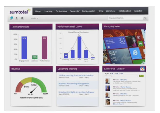
Figure 6. Example SumTotal site

The main difference between open source and commercial platforms is in terms of licensing fees: commercial LMS require licensing fees per user, usually on an annual basis, with a subscription and maintenance fee on top to make sure the LMS is kept up to date. Open source LMS platforms do not require a licensing fee, as they are developed under a GNU General Public License (GPL), and users only need to download the code. Open source platforms therefore provide freedom, in that modifications can be made to the source code according to users' needs, and the institution has the ability to change the provider in future if they want a better service. However, a commercial platform cannot be modified according to users' needs because commercial LMS are typically designed in accordance with a set of standards. This difference is significant and will influence the selection of a specific platform because in LMS selection, it is important for an organisation to consider how it plans to deliver training materials to the students, and the features of the LMS must meet the requirements of the organisation.