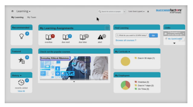
Figure 5. Example SuccessFactor site