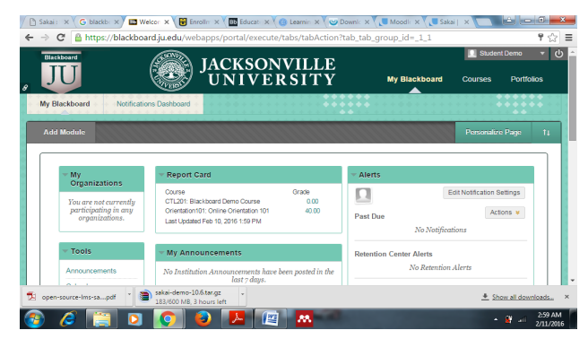
Figure 4. Example Blackboard site

Common features shared by all platforms are flexibility, ease of use, accessibility and user friendliness, while the feature that is lacking in all of the platforms is the ability to integrate with other systems, and only Moodle and Sakai have a personal area for writing drafts and journaling, and managing personal and private information. Meanwhile, only ATutor allows lecturers and students to coordinate and manage courses, as well as giving each user their own file storage utility that can be shared with other users, and allowing the content and structure of courses to be saved and backed up in the software. Giving the administrator the power to limit access to specific users or roles to a few users is only available on Success-Factors. SumTotal provides contextual learning, assessments of talent, and tools to increase the efficiency and effectiveness of workforce management. These features are less visible in the platform because each platform has its own advantages and objectives in developing the software for the use of certain parties.