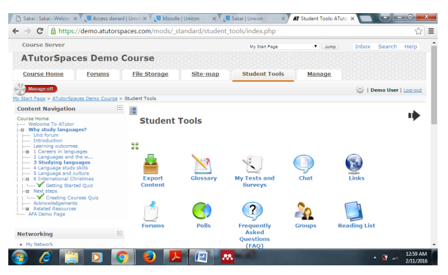
Figure 3. Example ATutor site