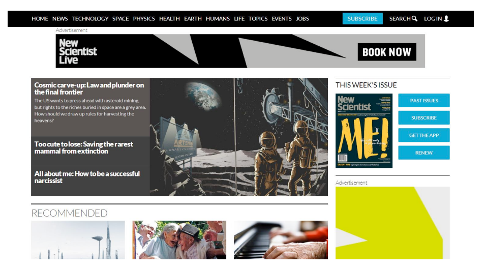
Fig. 2. English study platform