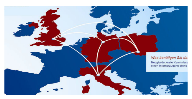
Figure 1. The LITERALIA project partners

The LITERALIA project started as a bi-lingual partnership between Germany and the UK. The German students were learners at the "Volkshochschule Ostkreis Hannover" (VHS), an adult education institution where learners are traditionally mature and of very varying educational background. The English partners were students at the Open University (OU), a distance learning institution where students are used to independent and self-motivated learning (Baumann 1999). In the pilot-phase, learners used predominantly email as a means of communication with the option of one organised face-to-face meeting per year when the English students were visiting Germany for their summer school. The project was extended after successfully arranging and supporting internet-based Tandem partnerships for two years.