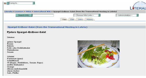
Figure 6. Use of the LITERALIA wiki

Language learning in an online environment allows students to get in touch with native speakers of their target language easily and frequently. Working in a multifaceted online workspace provides them with a choice of tools and pre-structured learning activities. In the LITERALIA workspace, for example, learners could choose whether they work asynchronously or synchronously, whether they collaborate in a wiki or discuss in a forum, whether they meet at a set time or organise their own meetings, and whether they meet their own Tandem partner or choose other learners for conversational exchanges.