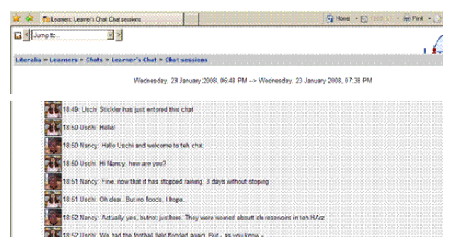
Figure 3. A Moodle chat-log

The Learners' workspace of the LITERALIA website contained five different chatrooms, four identified by place names (locations of participating institutions) and a general "learners' chat". Participation in the chat was voluntary and in addition to Tandem email exchanges between teamed pairs of learners. In the second project year chat sessions were organised weekly with participation of tutors and organisers, however, learners could also access the workspace and initiate chats independently at their own convenience.