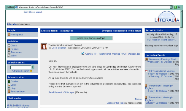
Figure 2. The Moodle Workspace

Overall 230 users were registered on the workspace, 25 of them trainers, organisers or teachers. Moodle automatically tracks activity on the workspace and regis-