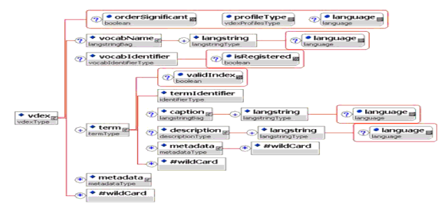
Figure 3. Syntactical structure of ims-vdex.

For each one of these forms of describing a vocabulary there is a specific ims-vdex profile.