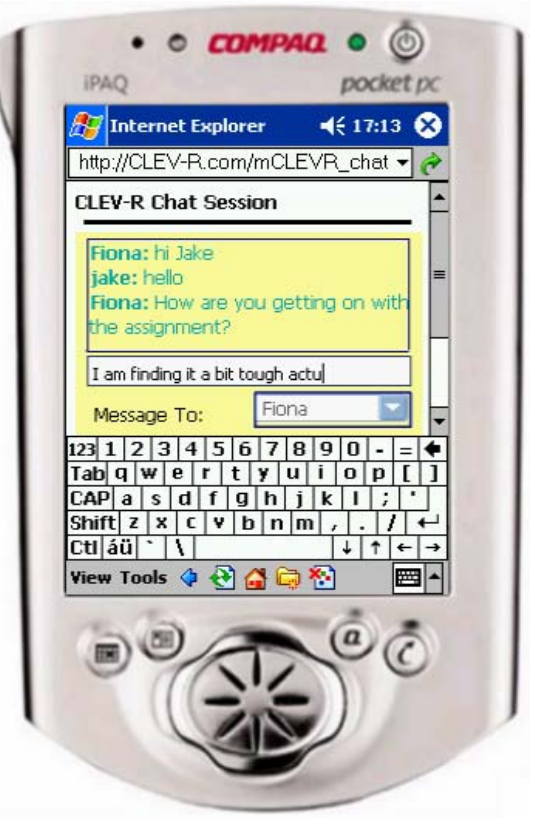
Figure 3: The text-chat interface of mCLEV-R

A major challenge when developing for PDAs is their small screen size and low resolution. Web pages have to be designed carefully so that the content is displayed in a legible manner. Limited input methods must also be taken into account when designing these pages so that the user can navigate easily. This limitation is a greater problem when the web page contains a 3D environment, which the user has to interact with. The mouse primarily controls navigation and interaction in the desktop system. This is intuitive for many; however, interaction on the PDA depends on a stylus, which may be unfamiliar to users. Thus it is necessary to provide further aid for the user. In mCLEV-R, a predefined list of viewpoints is provided for