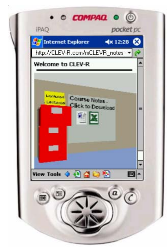
Figure 2: The 3D environment of mCLEV-R

The desk provides an area where students can access communication facilities and so interact with other users of the system. A laptop on the desk links the user to the same text-chat facility as the desktop version of CLEV-R and displays a list of all currently logged in users (see Fig. 3). All those connected can converse freely through this service thus linking mobile and desktop users. A 3D telephone links to a voice-chat facility, which allows users to chat via audio with others. This is particularly effective for mobile learners to listen to a live lecture commentary even if they are not present in the virtual lecture. It can also be used to collaborate with others during group meetings. Users can also link to announcements about the course. Unfortunately due to software limitations it is not possible to share events between mobile and desktop users. Therefore avatars are not present within the mobile 3D environment, and hence movements and gestures from the desktop system are not portrayed on the mobile device. The communication features provided do however create a social presence for mobile users and heightens their awareness of other system users.