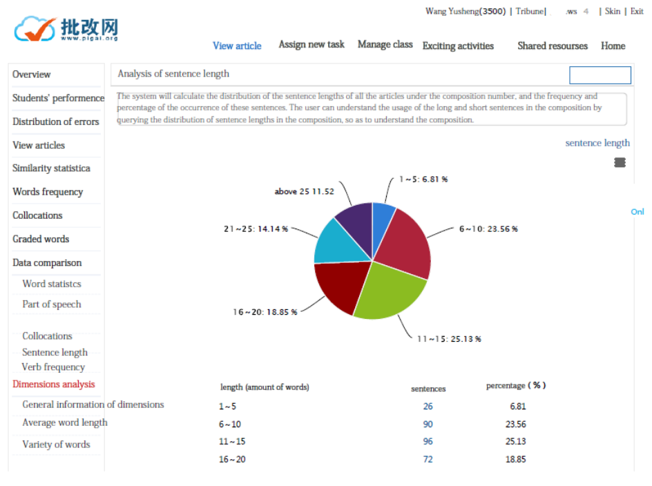
Fig. 4. Analysis of sentence length

As illustrated in Figure 4, students generally use short sentences, and the number of students with 6-10 words is as high as 24%. The total number of students with sentences of fewer than 15 words is 55%.