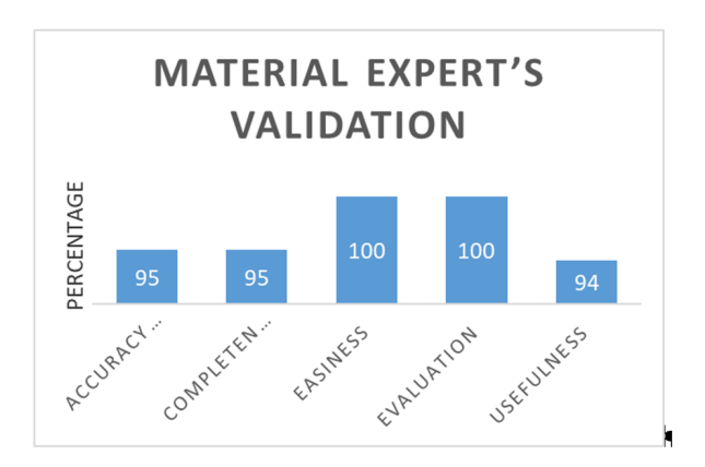
Fig. 1. The graph of percentage from material expert's questionnaire

The used material for composing digital book based on sigil should be firstly validated. Based on material expert's questionnaire, the digital book is valid as seen in: