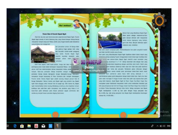
Fig. 7. Display the 3D page flip ethnic-constructivism module

After the development of the ethno constuctivistic module using 3D page flip was completed, a demonstration was held to elementary school students.