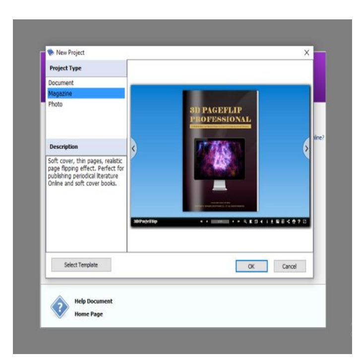
Fig. 2. After the following display appears select "magazine" and clicks "OK".