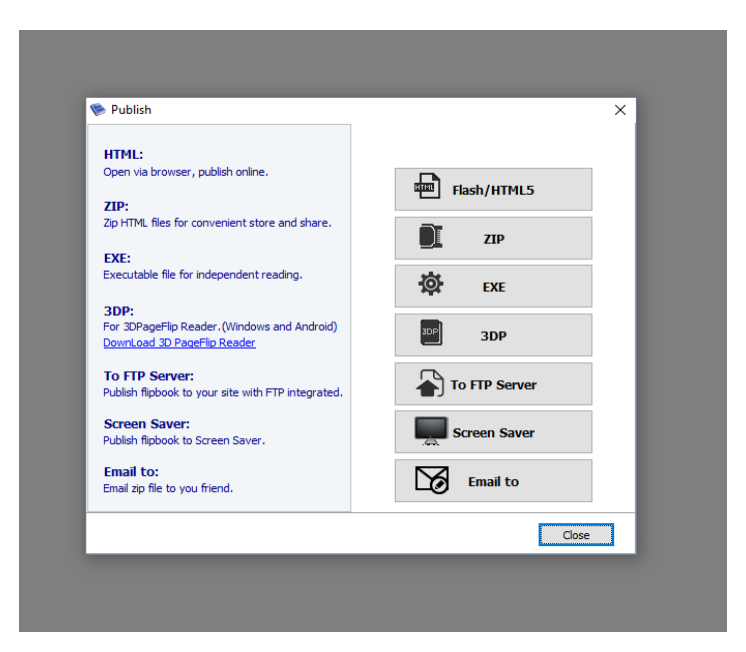
Fig. 3. Then the display will appear as shown above. Please select "3D" to make the module display into 3D page flip.