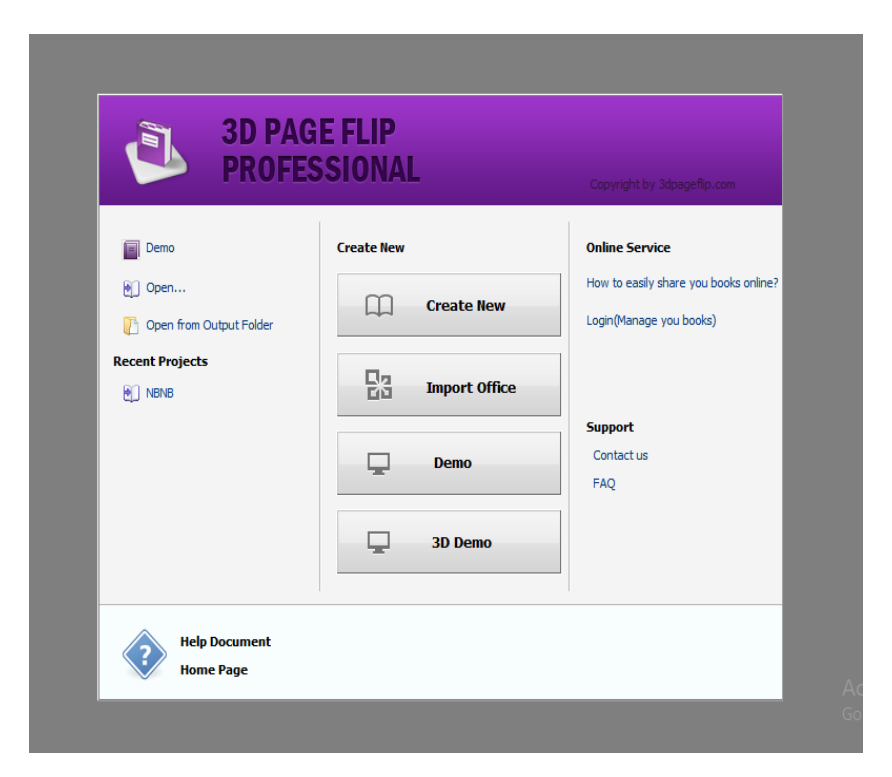
Fig. 1. The first step is to open a professional 3D page flip application, and it will reveal the display as above. Select "create now".

This study uses a development and evaluation methodology. [12] The R & D method is a research method used to produce certain products, and test the effectiveness of these products. The products produced from this research are in the form of 3D page flip ethno constructivist module teaching material that has been tested for its feasibility. The module development process here is to develop ethno constructivist modules in the form of a page flip 3D ebook using a professional 3D page flip application. The following is the step in creating an ethno constructivist 3D page flip module.