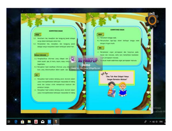
Fig. 6. View the 3D page flip ethnic-constructivism module