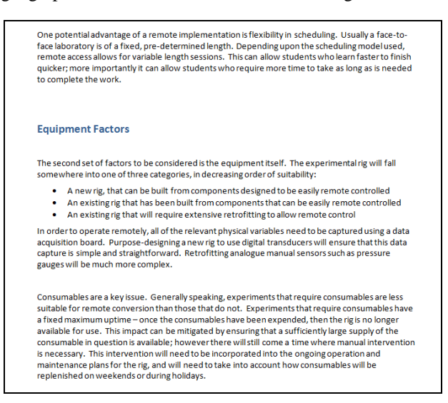
Figure 3. section of equipment factors influencing a rig's suitability

The characteristics of the student body making use of the lab will also play a vital role in assessing the suitability of a remote lab conversion. Ease of internet access, geographical distribution and the student to rig ratio are