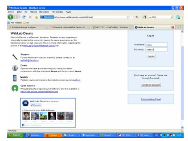
Figure 1. WebLab-DEUSTO main page and experiments

Today's WebLab-Deusto v4 is a robust platform that uses web standards suitable for mainstream web browsers, and adapts to mobile devices. It can be downloaded and deployed to serve new remote experiments in different environments and operating systems. The effort has been put to offer a secure and scalable design, using SSI in communications and allows for untrusting experiment developers in the management layers, providing tracking