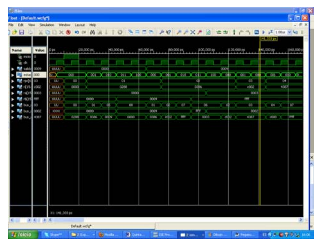
Figure 3. Simulation of a VHDL Code