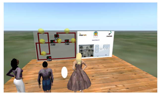
Figure 3. Interaction between 3D virtual world and remote experiment

The work described in this paper was partially motivated by the educational potentialities offered by the new ICT, namely the access to information, its interactive manipulation, and the possibility to derive new knowledge and skills from that very same interactive process. The full exploration of these new potentialities implies new educational strategies, new didactical approaches and also new pedagogical theories. Furthermore, the social competences and skills acquired during the utilization of these 3D virtual learning environments can be an added value if later used in a personal and/or professional perspective. Again, the ancient principle that schools prepare students for life is also applicable to the use of 3D virtual worlds in an educational perspective.