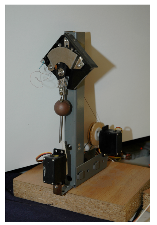
Figure 2. Experimental apparatus of the Pendulum Experiment to be deployed on e-lab.

In order to offer RCLs in such a way that any student at a university or pre-university levels can easily use it, a greater effort has to be made in simplifying technology usage and computer literacy. Also to this concern one of the perspectives that e-lab offers is the ability to allow students from these levels of education to develop and deploy their own experiment at their schools, and it is to this matter that greater developments still need to take place.