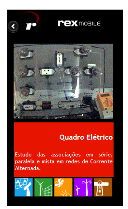
Figure 1. Screenshot of the Experiment Remote 'Electric Panel' in a Smartphone

shared with many other tasks. Inside the production for remote experimentation, it is essential to organize a mental model of data, functions and specific activities, in order for the student to understand and recognize these elements [8].