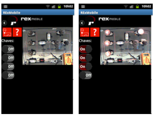
Figure 4. Interaction with remote experiment application on a Samsung S8530i with Android 2.3 OS

A further facilitated by the creation of resources ThemeRoller tool that allows for the definition of these patterns online. Tools that ensured useful patterns for application development.