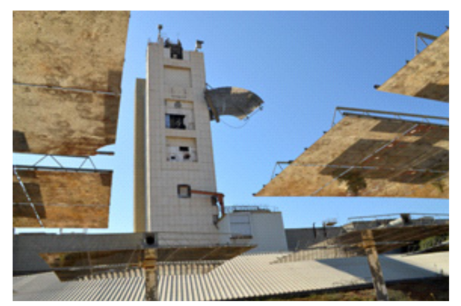
Figure 1. Solar tower

Boeing holds the current record for the efficiency of a multi-junction cell at 34.2 percent [1]. This is more than twice the efficiency of cells currently on the market, and efforts are being made to increase the efficiency up to 40 percent.