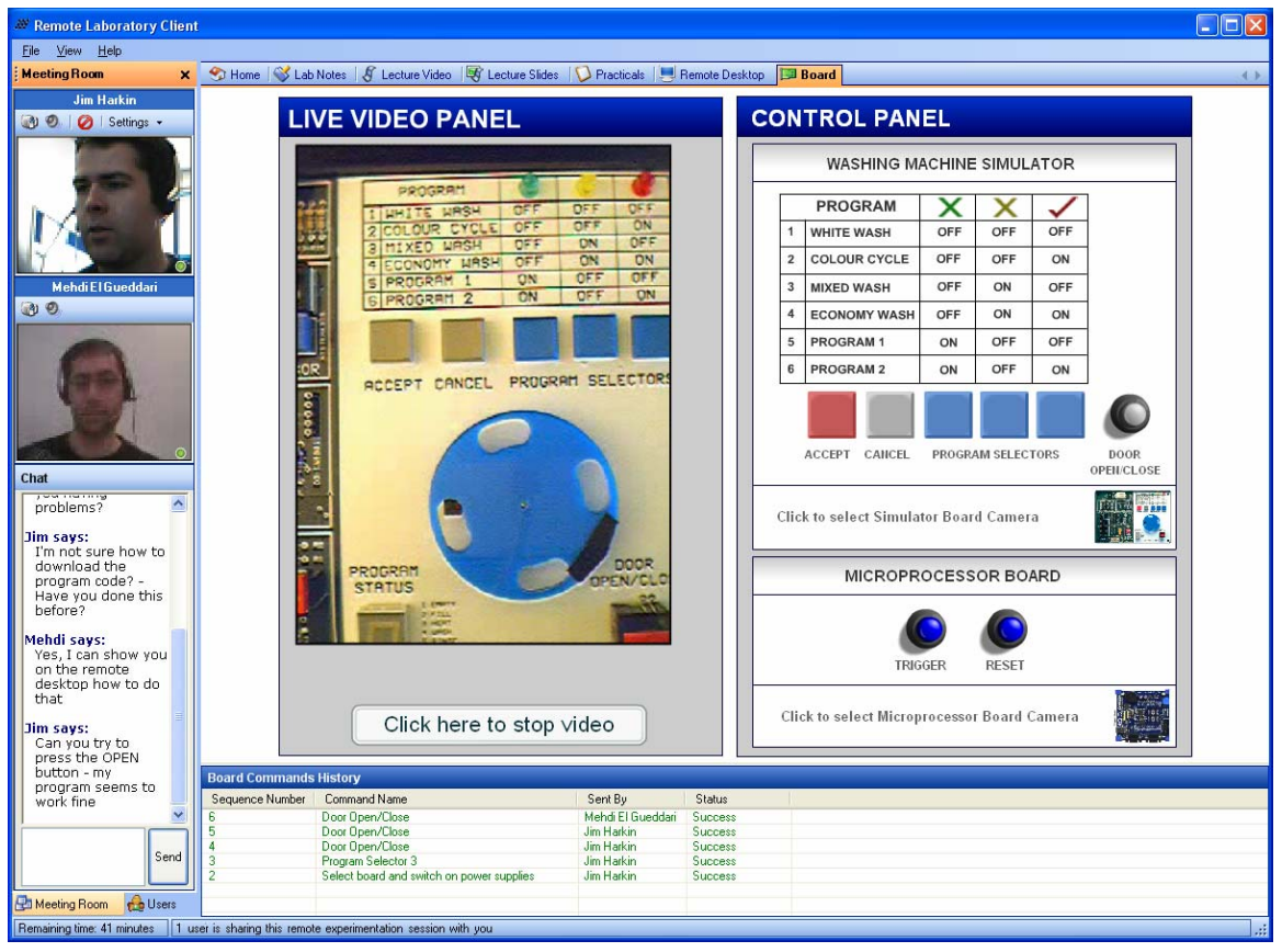
Fig.4 ProculTech Environment - board control interface with symbols